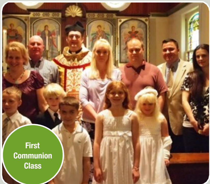
First Communion Class

St. Uriel's is a parish that seeks to listen to the small still voice of God and then respond.